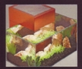
360° Viewing Glass top for spectacular views from all angles and

Fluval EDGE brings an exciting new look to aquatics, combining the most modern aquarium design with the beauty of nature. The result is an utterly stylish complement to any home or office space.