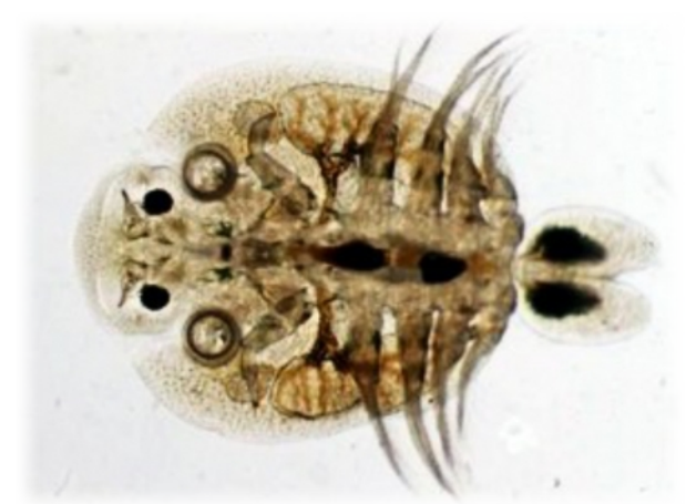
Argulus or Fish Louse - A parasitic Crustacean of the family Argulidae.

the body or against the pupil of the eye as a pale coating.