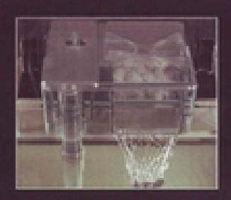
Clear Healthy Water

less evaporation for reduced maintenance