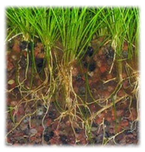
A good quality substrate Is essential for healthy plant growth

"root" Substrates are the and foundation of the system. Starting with a quality gravel (such as Seachem's all mineral rich natural and gravels: Flourite<sup>™</sup>, Flourite Red<sup>™</sup>, or Onyx Sand™) lays the foundation for further success. Although a low cost gravel may save money in the short term this will be more than offset by a necessitated increase in use of supplements to make up for the shortcomings of such gravels. If a quality gravel is employed one could actually just add a few fish and have a successful planted aquarium.