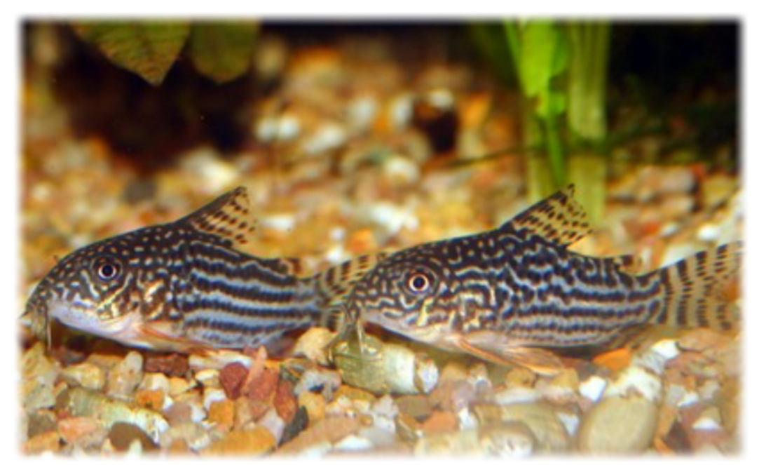
'A FEW CORYDORAS CATFISH CAN ADD ACTIVITY AND INTEREST TO THE SUBASTRATE AREA'

The majority of available fish are compatible (size for size, of course) otherwise your dealer wouldn't be able to stock them in large numbers in the same tanks - he wants a quiet and convenient life! Most fish are adaptable to variations in water temperature, as long as these occur slowly. When you bring your fish home from the aquatic dealer, it's good practice to float the bag containing them in the aquarium for around 20 minutes to equalise the water temperatures before releasing them into their new home. Similarly (and this is something that all new fishkeepers worry about), if you have a power cut, the aquarium will not suddenly go cold. Even with modest sized aquariums, the water will still take some hours to cool down - even if the central heating goes off too! To retain warmth, wrap the tank in a thick towel or bubble wrap. And, just to make you think, you can go away on holidays: your aquarium, if wellestablished and running normally can be left to its own devices for a couple of weeks without attention. It's better than asking an inexperienced neighbour to 'look after them' and risk the fish being overfed from that whole tin of fish food you left.