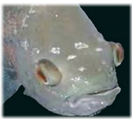
Hexamita or 'Hole in the Head' Disease

If you have a look at the range of disease treatments that are commercially available you will notice that most treat a range of parasites – which is the reason that it is not necessary to identify the species of exact parasite. Treatments are available for fungi - which treat the majority of fungal species that grow on fish; or skin protozoan parasites, which will control the many species of Costia, Chilodonella and Trichodina which irritation cause and mucous production when present in large numbers.