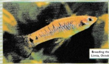
Breeding the Blue Limia, October, 19

Y Yellow Perils (March, 60) Yorkshire Aquarists Festival (December, 52) You Did What? (September, 51) You Write (April, 80; November, 76; December, 78)