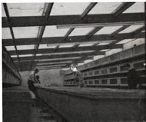
Tropical plant cultivation at Tachbrook's English Nursery

▼ Views of Tachbrook's Singapore Fish and Plant Nursery ►