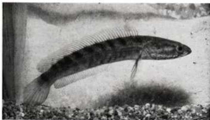
Striped snakehead ( Channa striata )

THE beauty of many of our tropicals belies the harshness of conditions under which they must survive. Not only are the smaller members of the aquatic realm subject to constant predation by their larger brethren, the larger ones are often in their turn to become the victims of the two-legged predator. Man, however, in his mere stewardship of earth, can hardly approach in the temporary pressures that he might apply against aquatic creatures the countless and seemingly impossible obstacles to survival which have been mastered in the past. Not the least of these is the ability of some fishes to live in water unfit for living, or even to leave the water if conditions become intolerable.