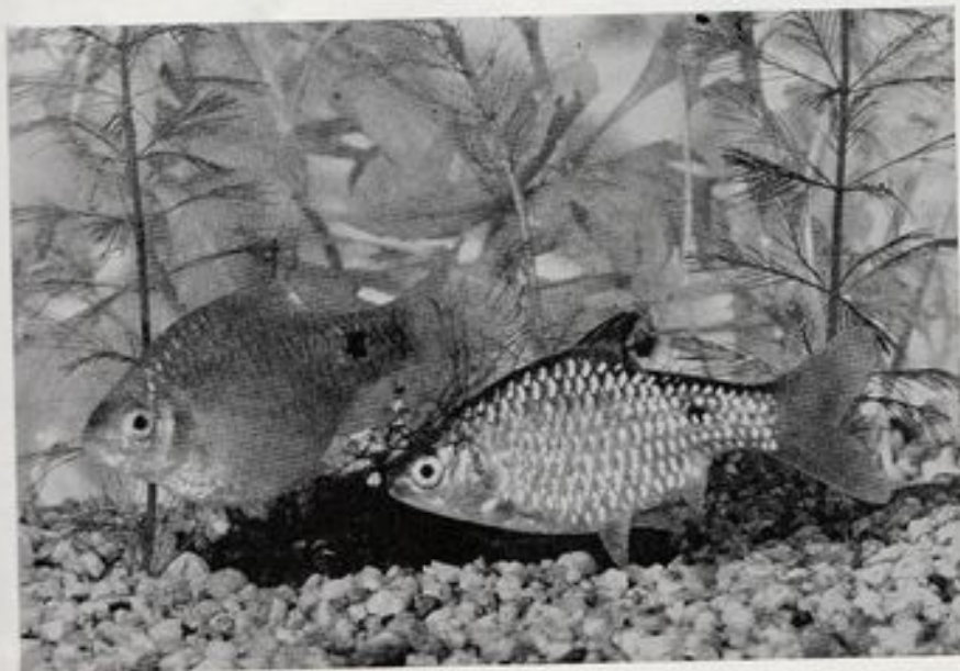
Barbus conchonus (Hamilton-Buchanan)

T HIS barb from northern India, Bengal and Assam, which is bred in many aquaria, is a 'top ten' inhabitant of the fish world on many counts. Were I not afraid that many advanced aquarists might feel insulted, I would say that this was an ideal fish for beginners.