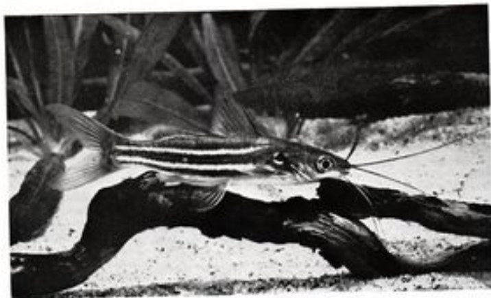
Mystus tengera (Hamilton-Buchanan)

T HIS very rare fish from the Bagridae family comes from the slow-moving and static waters of northern India and grows to a considerable size, up to about 7 inches even in the aquarium. However, they are quite suitable for keeping in captivity. They differ from the more generally available Pimelodella only in the number of their barbels—the pointed jaw of the Mystus tengera has four pairs \frac{1}{2} – 1\frac{1}{4} in. long.