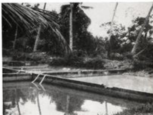
Tachbrook's plant-holding ponds in Singapore

It is much more than a shop. Its offices are constantly in touch with importers and exporters all over the world. International visitors who visit London make Tachbrook a must to visit. No wonder! From the ground floor up, Britain's finest display of everything of interest to the aquarist is set out in modern spacious surroundings. Experienced staff are always at your service and ready to give advice or help.