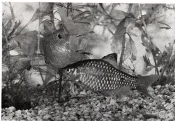
During the courtship and chasing of the female by the male the excitement causes her egg tube opening to become relaxed. The male (right) nudges the female's abdomen with his head and stays close by her side as she swims into the planted part of the aquarium.

After the mating, the parent fish should be removed without delay.