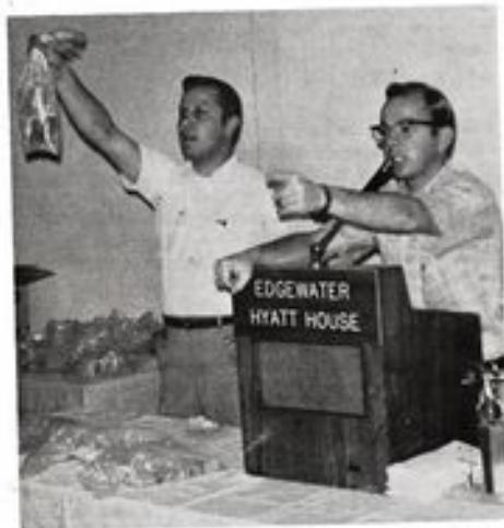
After the International Guppy Show in Long Beach, California, all the 'shipped-in' entries were auctioned off to breeders at the Show

A LTHOUGH we very soon found that there are plenty of good things to see and do in and around Los Angeles, the trip by my wife and myself to the States was rather more concerned with seeing how the Californians approach the guppy hobby. In staying at the Edgewater Hyatt House at Long Beach we were right in the centre of things, as the South California Guppy Association were holding their annual International Show at this particular venue.