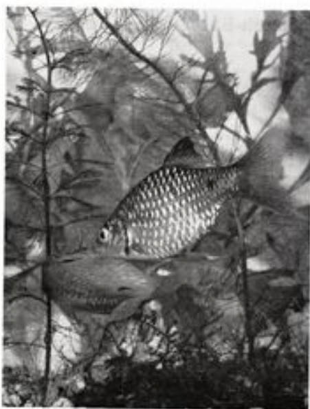
An unusual response of the female occurred during this pair's courtship: she turned completely on to her side as if in submission and as seen above the male appeared somewhat nonplussed.

The pair of fish I have photographed introduced one or two rather unusual actions into the prelude to the spawning. At one point, the female turned on her side in an attitude of submission, and the male looked on at a complete loss as to his next move. Then, when the first attempt at spawning took place, the female, who was a particularly agile fish, tried to reverse the usual roles by placing her tail fin over the male's body. Normally, of course, this is an action of the male. When this male tried to get his dorsal and tail fin over the female's body he was not nearly as successful! During the spawning the fish are continually swimming about, sometimes racing up to the water's surface, sometimes swimming close together and strewing the eggs in the plants. The dropping and fertilising of the eggs takes place again and again at short intervals and continues for about 2 hours.