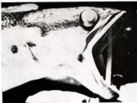
Teeth of the red-striped snakehead ( Channa micropetites ) revealed in a dead specimen

If regular feeding schedules are maintained, most specimens rather quickly learn the routine and their restlessness or even impatience may become evident if there should be a delay of some sort. One species I