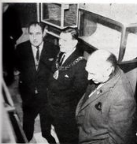
The Mayor of Brent performed the official opening of the Palace in Wonderland in north London recently.