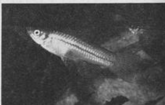
Female green swordtail, in which the gravid spot is visible as a shaded area above and between the ventral and anal fins

It is debatable whether frequent breeding with either livebearers or egg-layers adversely affects the health or growth of a fish. Assuming that sufficient amount of the correct food is available this is unlikely to be an important factor. However, where the diet is deficient in quantity or quality it is inevitable that the added strain of pregnancy