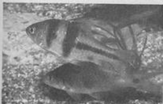
Spanner barb ( Barbus lateristriga )

Aquarists can divide the barbs into two types, large ones and small ones, and although the large barbs are very attractive, they soon outgrow their companions in the ordinary community tank and are best kept with fishes of approximately their own size. A 36 in. tank can house