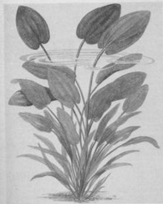
Echinodorus rostratus (synonyms E. cordifolius ; Alisma rostratum ; A. cordifolius ; A. foliis cordatis obtusis )

This popular name is derived from a fancied resemblance to the swords carried by those warlike females the Amazons, and has no connection with the river of that name, but bearing in mind the variation of leaf-structure within this genus of South American plants, aquarists would be well advised to memorise and use the name Echinodorus rather than to persist with the term Amazon sword—with some descriptive tag such as "broad-leaved," "narrow-leaved," etc.—which emphasises the leaf shape of one species ( E.