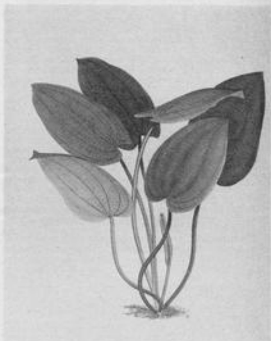
Unidentified species of Echinodorus