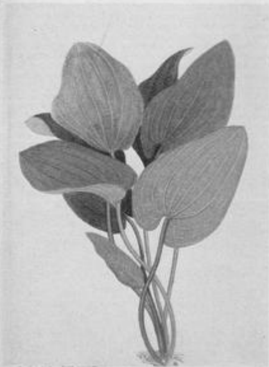
Echinodorus radicans (synonym Sagittaria radicans )