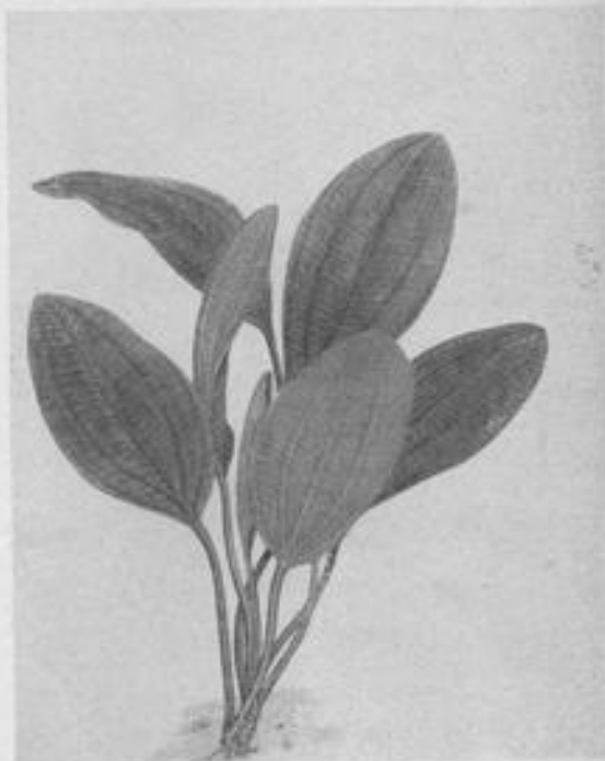
Echinodorus grandiflorus (synonym Alisma grandiflorus )

paniculatus ) and overlooks the more spectacular and pleasing leaf shapes available within the genus.