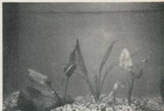
Cryptocoryne griffithii , C. willisii and C. versteegi (left to right)

A genus which has been used in aquaria for some time, but whose species are always very expensive, is Amblystichia ; A. lanceolata (water aspidistra) is most frequently seen, and it has thick, tough, glossy, dark-green leaves about 6 in. long and up to 1½ in. wide, rising from the root stock. This species, and its relatives, A. nana and A. congensis , are slow growing and their leaves stay fresh for a long while. They reach their full length of 2 ft. only if grown under natural bog conditions. When the root stock grows sufficiently large it may be divided; this is the only real method of propagation as seeds are rarely available. Just as uncommon as Amblystichia , but slightly less expensive, is Aglaonema simplex , which comes from Malaya. This should be called a "spear plant," because its pale-green leaves are beautifully shaped, like a perfect spear-head, with fine,