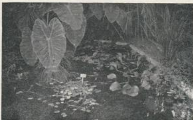
Hydrocleis commersonii (centre) and Eichornia crassipes (to the right) making good growth in a tropical pool

In addition to shading the aquarium from excess of light, floating plants are usually just as attractive and interesting as those grown for underwater effect. They are often difficult to grow, however; this may be due to the proximity of the bulbs and their very bright light, and at times con-