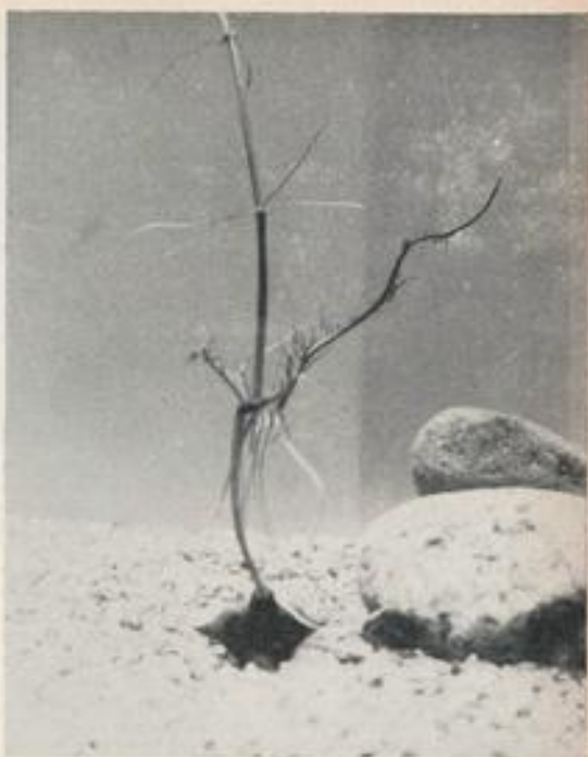
Water chestnut ( Trapa natans ) showing the horned "nut" and junction of primary shoot, dormant secondary shoot and upwardly directed root. Newer roots are growing downwards and other roots forming in the place of leaves are seen on the primary shoot.

Although Acorus is a true flowering plant (it is a relative of the sweet flag of the pond) Isoetes is related to the ferns, but is quite unlike them in appearance. Isoetes lacustris is