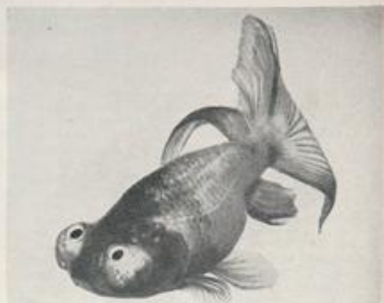
One of the males produced by pairing a female of the son-to-mother spawning with the male of the second generation (i.e. pairing daughter to father)

time to become apparent. However, provided that a sufficient number of the various generations are retained in health, the introduction of fresh blood should prove costly rather than difficult, thanks to the great advance in air transport.