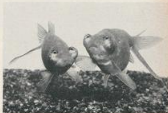
Pair of young celestial goldfish bred from the author's first pair. The male fish is on the left

The next step was to cross the young male with his mother and here the result was very different. Apart from the