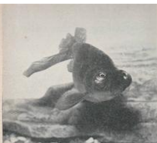
This male is one of the young obtained by pairing the male of the second generation to the female of the original pair (i.e. pairing son to mother)

pond, and failure to ensure adequate removal of decaying vegetation will cause the death of the hardiest of fish, once the pond becomes frozen over, because the gases evolved by this decay will be trapped by the ice and cause their asphyxiation. Such decay also increases the risk of bacterial infection, and whilst this may be slow to develop during the cold period, the rise in temperature with the coming of spring will quite likely produce an epidemic amongst the stock.