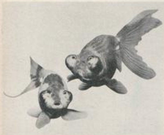
The author's original pair of celestial goldfish, imported from China. The male fish is on the left

When, however, specimens are rare and costly it would obviously be unwise to have them all situated where observation was precluded, for the death of these developed types, especially of those with the enlarged eyes, may well stem from injury due to the rough concrete surfaces of a