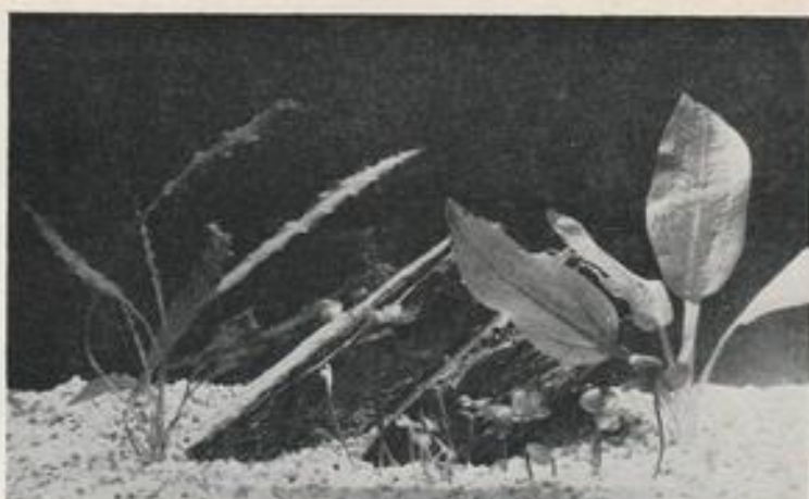
Left, Aponogeton undulatus ; right, Echinodorus radicans . Marsilea quadrifolia is growing in front of the rock

In suitable gravel it produces many slender stolons which root and form rosettes of leaves at the nodes.