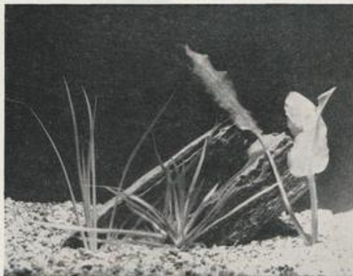
Left, Acorus pusillus ; right, Cryptocoryne versteegi

Pistia stratiotes (water lettuce) and Eichornia crassipes (water hyacinth) have been grown in aquaria for a very long time, always fetching high prices among plants. The