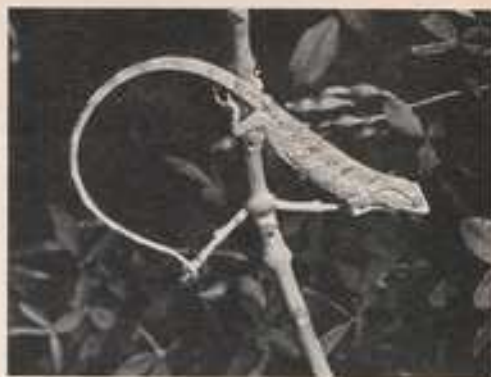
The long tail and inconspicuous eye are features to note about the long-legged iguana.

It is difficult to predict the price likely to be charged for specimens, as it is most variable. They may be obtained for as little as 30s. They are certainly a most interesting and unusual lizard species to keep and I can strongly recommend them from my own experience. They are especially suitable for the discerning collector who wants "something different", yet the ease with which they can be kept brings them within the range of the comparative amateur to semi-tropical reptiles.