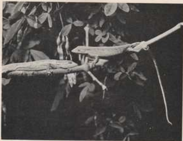
Beautifully camouflaged long-legged iguanas

T HE long-legged iguanas of the genus Polydora are fascinating lizards which are at home among the vegetation in the forests of tropical South America. When one thinks of lizards adapted to an arboreal existence the chameleon group springs to mind at once, and it is interesting to see how in some ways the long-legged iguanas have independently achieved many of the chameleons' advantages. They are beautifully camouflaged, as the photographs of my specimens (of the closely related species Tropidurus semitaeniatus ) show. It is not hard to imagine them among the tropical lianas being mistaken for a vine stem or piece of dead bark.