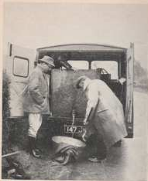
Oxygenated water tanks in a van are used to transport the coarse fishes.

of room, therefore, and the buoyancy tanks fitted along the sides of the boat are indeed necessary!