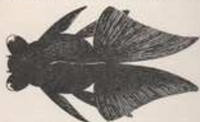
Moor goldfish seen from above and (right) the characteristic appearance of telescopic eyes and nasal flaps of fancy goldfish (from the Federation of British Aquatic Societies "Show Standards")