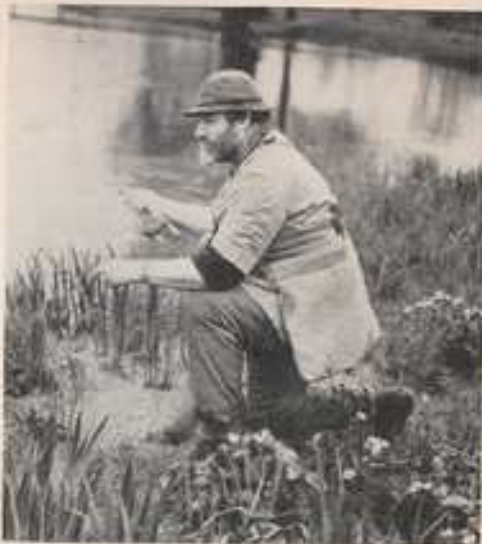
Mr. James Robertson Justice is one well-known trout fisherman who fishes the Itchen waters

Such is but a glimpse of some of the amount of "interference with the balance of Nature" that goes on upon such valuable waters as the Hampshire Itchen and Test. When you are next leaving over one of our bridges, and you can see trout 30 yards away, even though it be 4 ft. down in the water, and you are enjoying the infinite variety of greens which make up the tapestry of our lovely valleys, you may reflect that without this interference there would