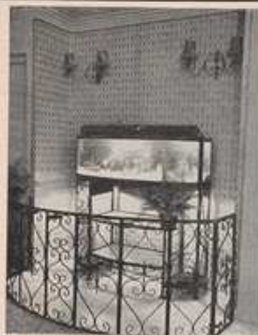
We are specialists in aquarium installations. All sizes and styles to customers' own specifications carried out. We have many designs set up in our showrooms. Why not call and let us quote.