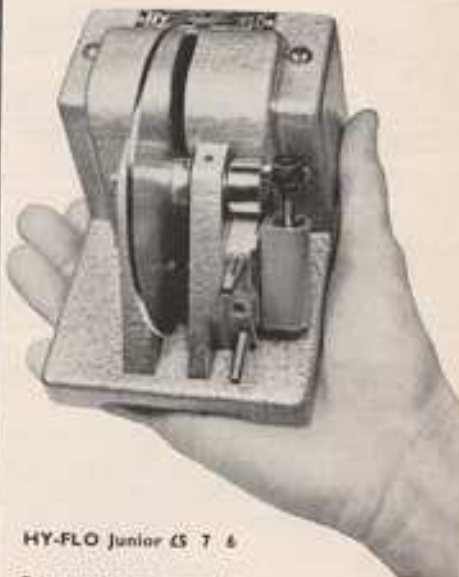
HY-FLO Junior £5 7 6

pumps, models Junior, 'A' and 'B' finished gold dimple enamel paint are now fitted with nylon double acting pistons and cylinders with two outlets from each cylinder. SILENT and self-starting.