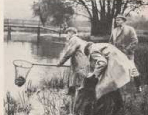
In these pictures coarse fishes removed from the trout streams are shown being transferred to new waters