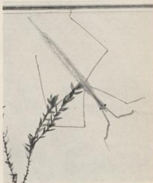
Fig. 1. Ranatra linearis in the act of respiring at the water surface

At the end of the abdomen is a long thin "tube." On closer inspection this is seen to be a pair of filaments, which, when brought together form a channel down the centre, and they are locked by stiff hairs. This tube is the sole respiratory organ, and has access to the whole tracheal system which terminates in two stigmata at the tip of the abdomen, and at the base of the respiratory filament.