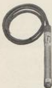
A1 Heater 9/9 plus 6/6 Purchase Tax