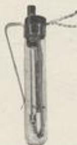
A1 Thermostat 28/6