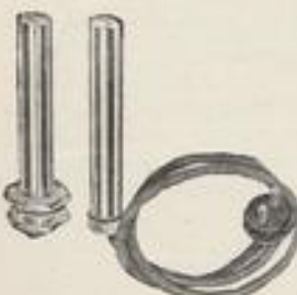
A2 Base heater 39/6 Plus 26/4 Purchase Tax